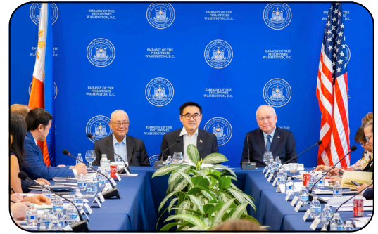
(left to right) Governor Remolona, Secretary Go, and Ambassador Romualdez

On the sidelines of the World Bank/IMF Spring Meetings in Washington, the Council partnered with the U.S. Chamber of Commerce to convene high-level engagements with ASEAN government delegations. On April 14, the Council and the Chamber co-hosted a roundtable with Secretary of Finance of the Philippines Frederick Go and Bangko Sentral ng Pilipinas Governor Eli Remolona. Secretary Go shared perspectives on the country's economic outlook and investment priorities, while member companies discussed business opportunities, legislative priorities, and digital innovation. The following day, the Council and the Chamber co-hosted a roundtable with Minister of Finance of Indonesia Purbaya Sadewa and Bank Indonesia Governor Perry Warjiyo. This marked Minister Purbaya's first visit to Washington in his current capacity, where he discussed Indonesia's fiscal and monetary strategies amid global economic uncertainty, bilateral relations under the Agreement on Reciprocal Trade, and key sectoral issues.