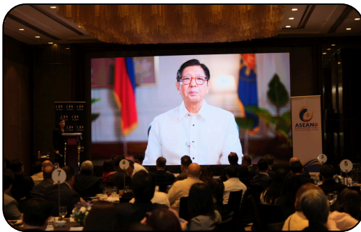
Philippine President Ferdinand R. Marcos Jr.'s ASEAN Chair Response