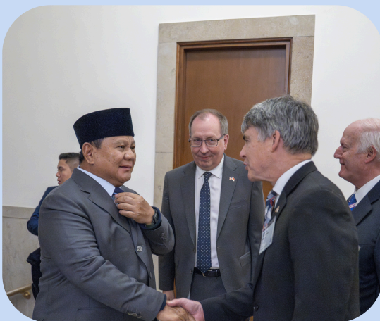
Meeting President Prabowo in February