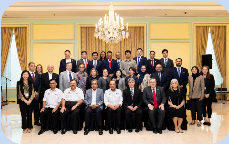
Meeting YAB Prime Minister Dato' Seri Anwar Ibrahim in May

Six months into 2026, I'm proud of USABC's unrivalled ability to connect member company representatives with ASEAN Member State governments. We've held 85 events so far, including meetings with President Prabowo of Indonesia, President Marcos of the Philippines, and Prime Minister Anwar of Malaysia; met the new Prime Minister of Vietnam and the Deputy Prime Ministers of Singapore and Thailand; carried out a multi-sector roundtable series connected to the Philippines ASEAN Chairship; completed 10 country and sectoral business missions, and more. Still on the learning curve as CEO, I am continually impressed by my USABC colleagues' energy and creativity, developing new special projects that address members' needs, advocating effectively in all ASEAN markets, and backing each other up when we need to surge to cover major business missions. We are all about our members, so please reach out to me with your ideas and suggestions on how USABC can do better ( bmcfeeters@usasean.org ).